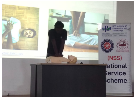
Click to View