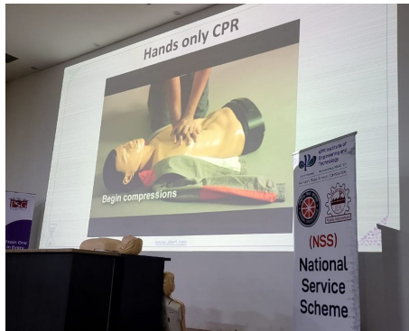
Click to View